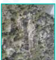
Karakaya District - Anıkcı Cemetery